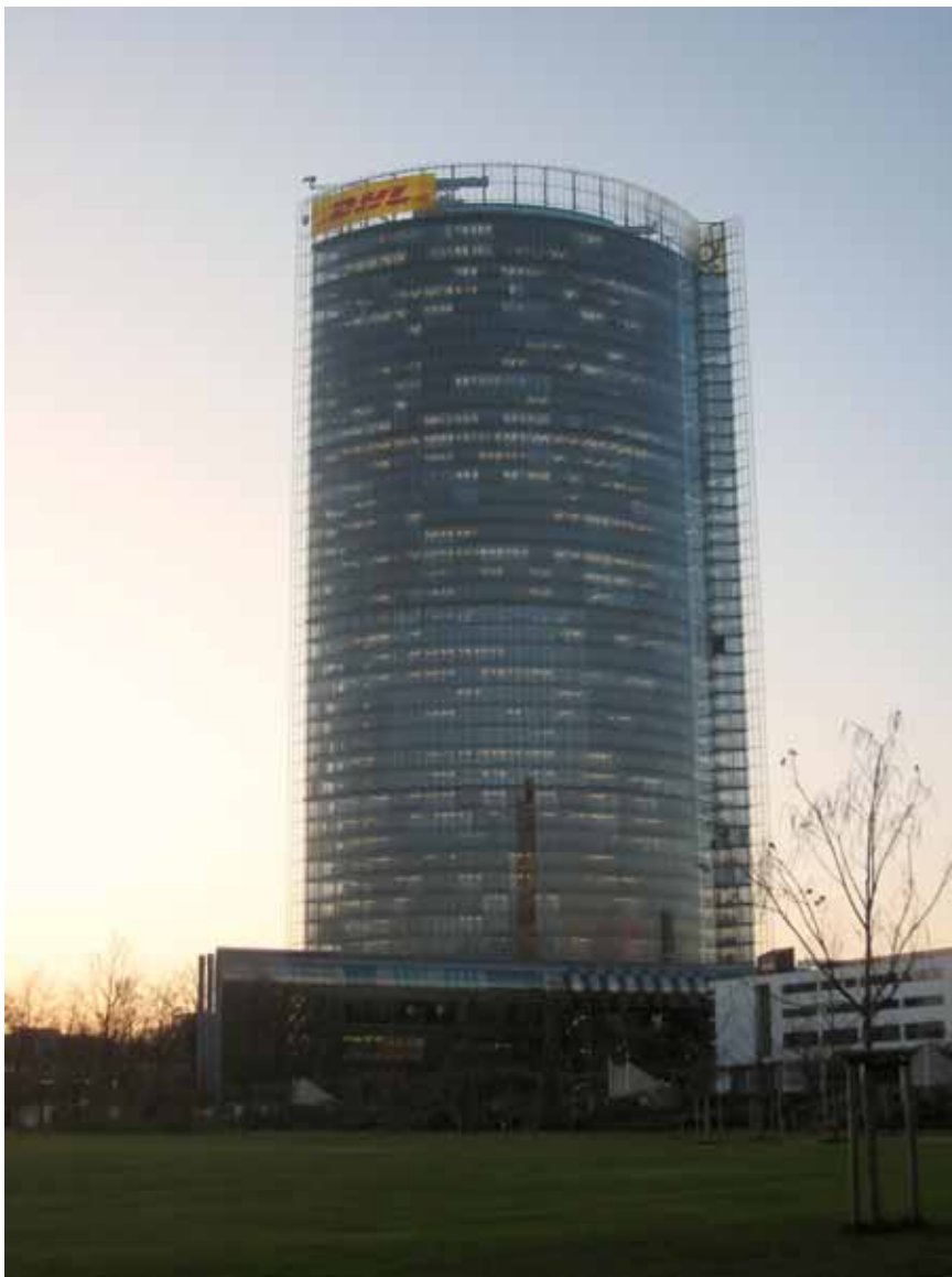
The Deutsche Post Tower in Bonn, site of the European DDI Users Group meeting (EDDI) in December.