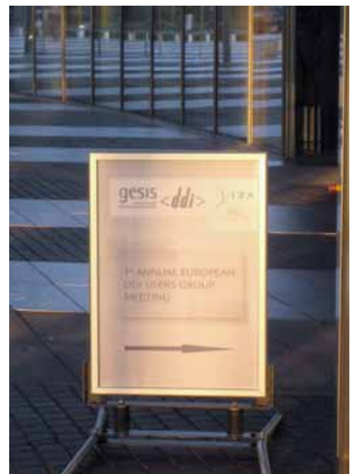
Sign welcoming participants to the first annual EDDI meeting.