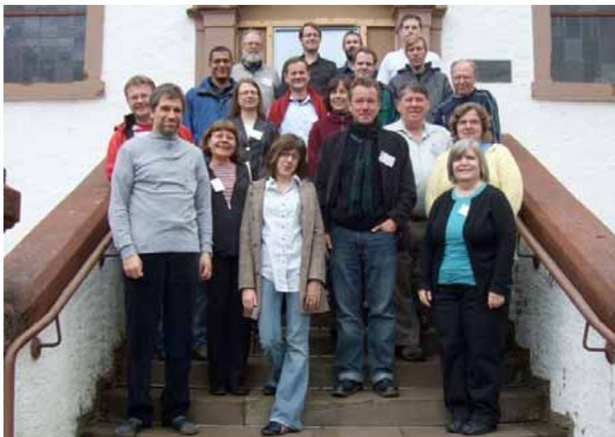
Participants in the 2009 Dagstuhl Use Case Workshop

Welcome to all! We look forward to meeting with you in 2010.