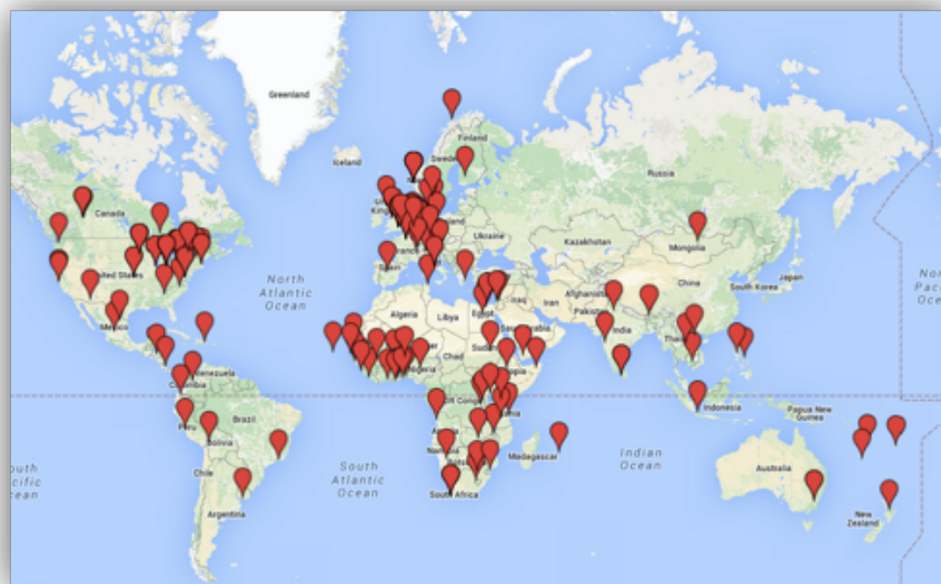
Map of global DDI usage